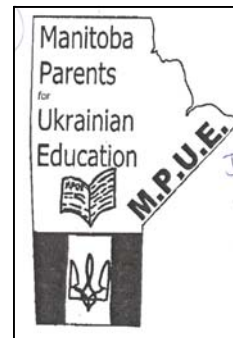
Smith-Jackson Grade 4 class