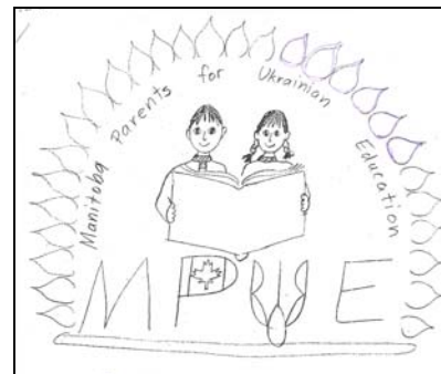
R. F. Morrison School Grade 2 class